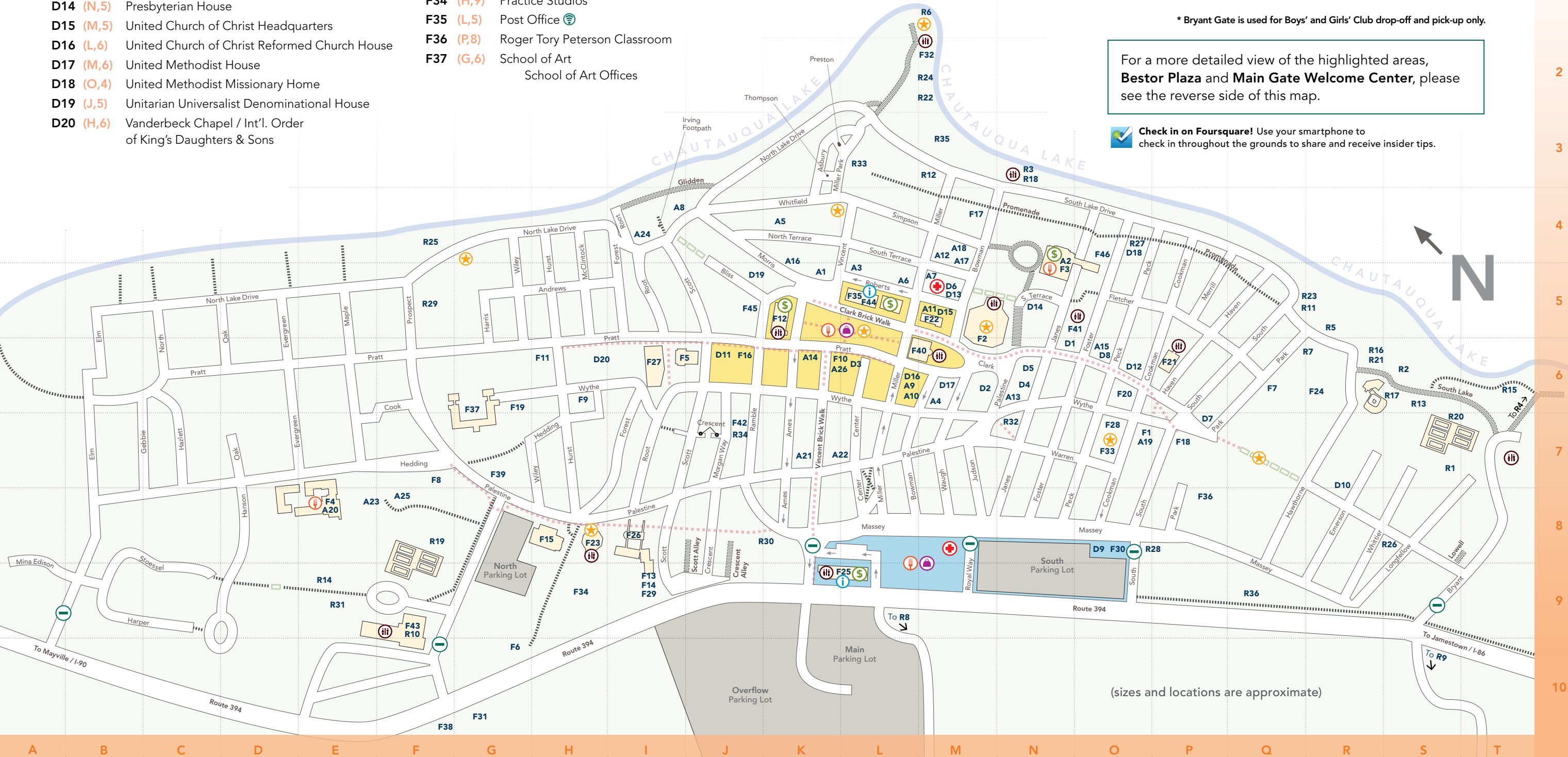
(sizes and locations are approximate)

Check in on Foursquare! Use your smartphone to check in throughout the grounds to share and receive insider tips.