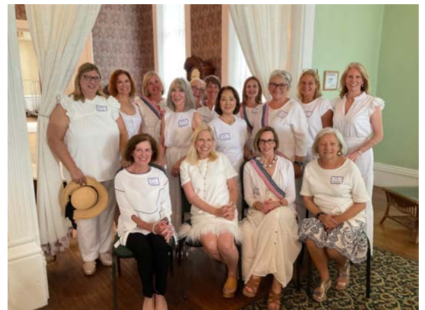
2021-2022 Board of Directors at Life Member Luncheon

"The Chautauqua Women's Club provides innovative programming, dynamic events, leadership opportunities for women, and life-changing scholarships for students."