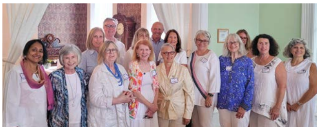
2022 Life Member Luncheon

New Life Members who joined since our last celebration (July 17, 2022) are invited to attend as complimentary guests.